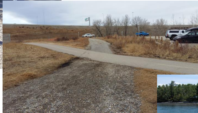
View of the boat ramp looking across to Bowness Park. The ramp is a double lane concrete interlocking slab base