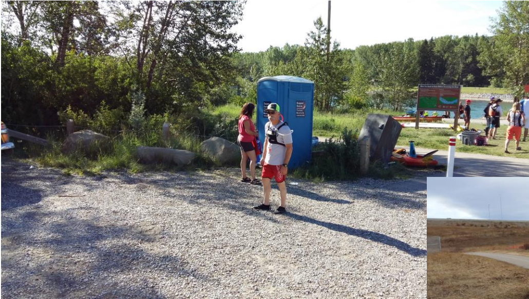
View from the parking lot looking south to the boat ramp.