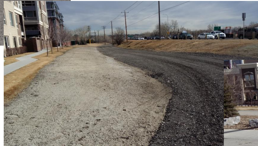
Figure 17: Access of 17 A St. SE. was closed with the condo development. Should it be reopened to the public?

Figure 16: The recently renovated roadway access to the boat ramp. Wider and upgraded from what was there prior to the condo development. Adequate in-line truck/trailer parking