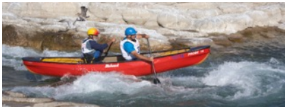
Figure 1 Passing through in a Canoe