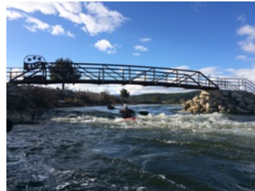
Figure 8 Bridge at Kelly's Whitewater Park, Cascade, ID