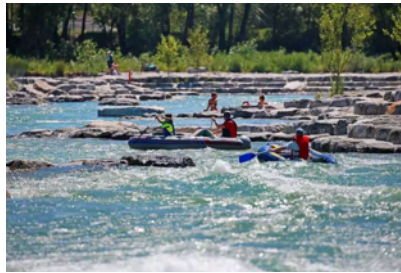
Figure 3 Rafting the low water channel