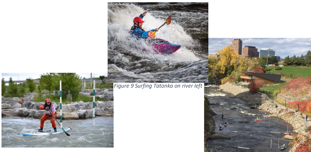
Figure 9 Surfing Tatonka on river left