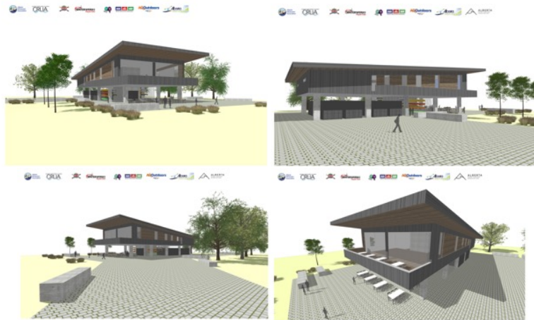
Concept drawings funded by The Parks Foundation