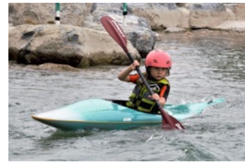
Figure 2 Learning to paddle

The Harvie Passage Task Force is being formed with the purpose of creating a Facility Enhancement Plan. The Calgary River Users Alliance celebrates this step and offers the following recommendations and/or items to consider to make a vibrant and safe facility, that is being used to its potential.