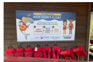
Figure 6 PFD Lending Program, BC