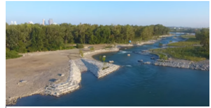
Figure 4 Trailered Boat Ramp