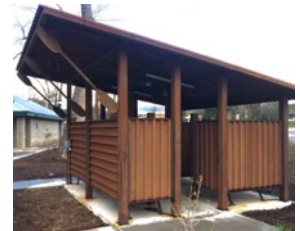
Figure 5 Changeroom, Durango, CO